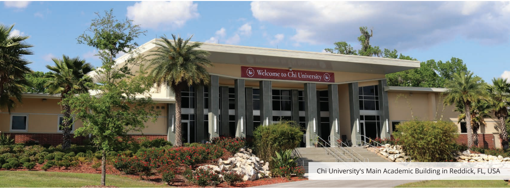
Chi University's Main Academic Building in Reddick, FL, USA