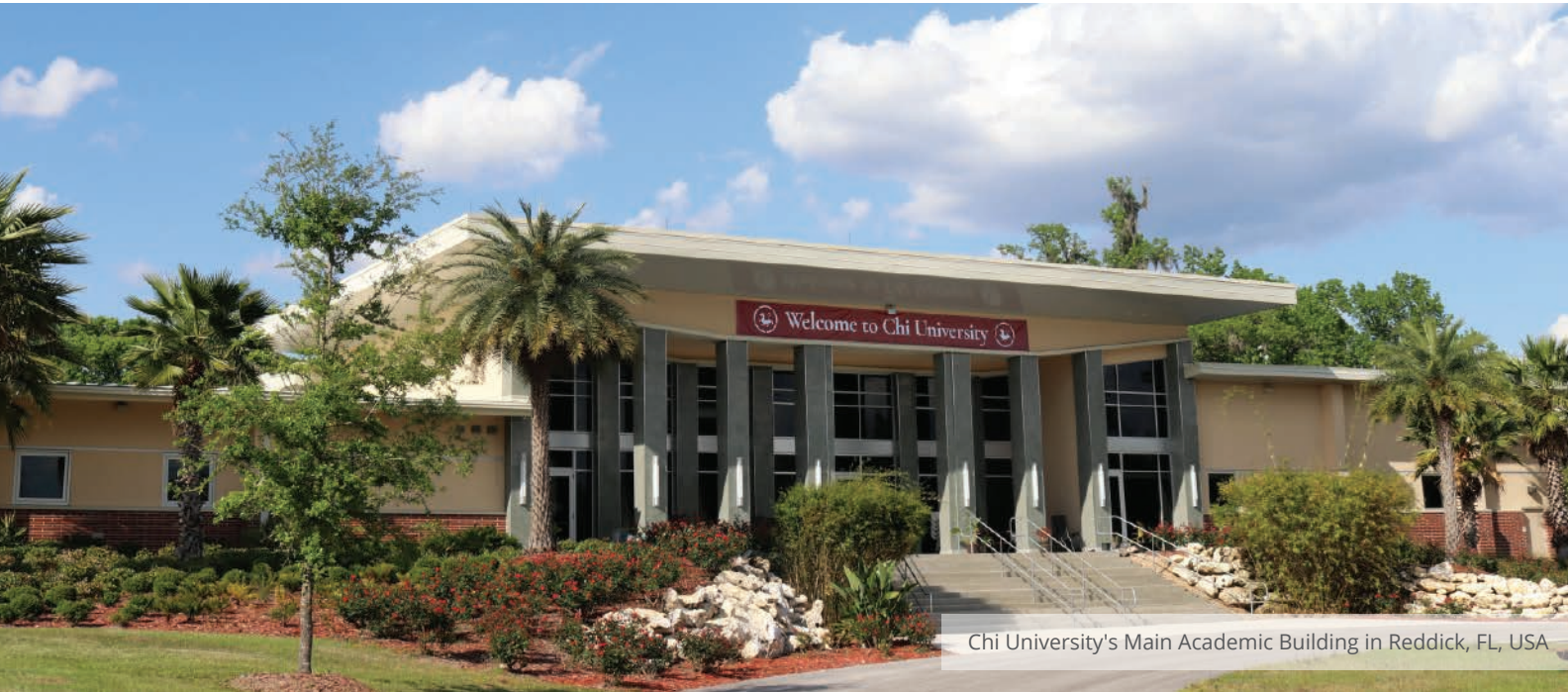
Chi University's Main Academic Building in Reddick, FL, USA