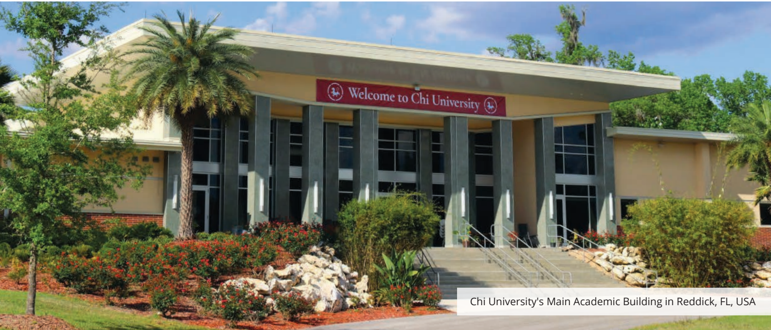
Chi University's Main Academic Building in Reddick, FL, USA