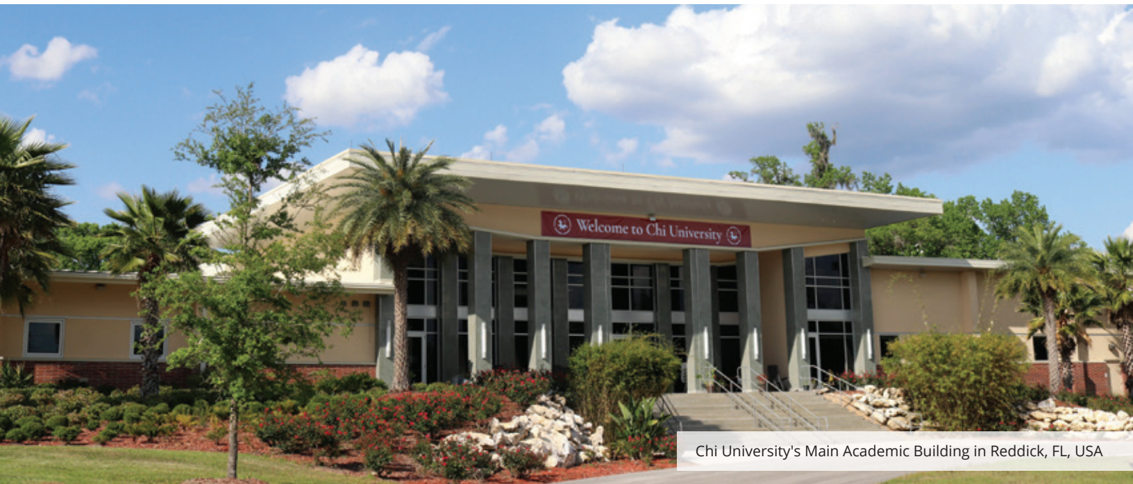
Chi University's Main Academic Building in Reddick, FL, USA