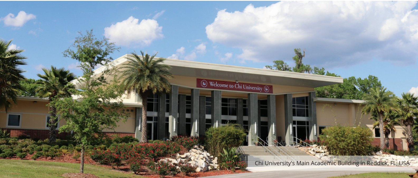
Chi University's Main Academic Building in Reddick, FL, USA