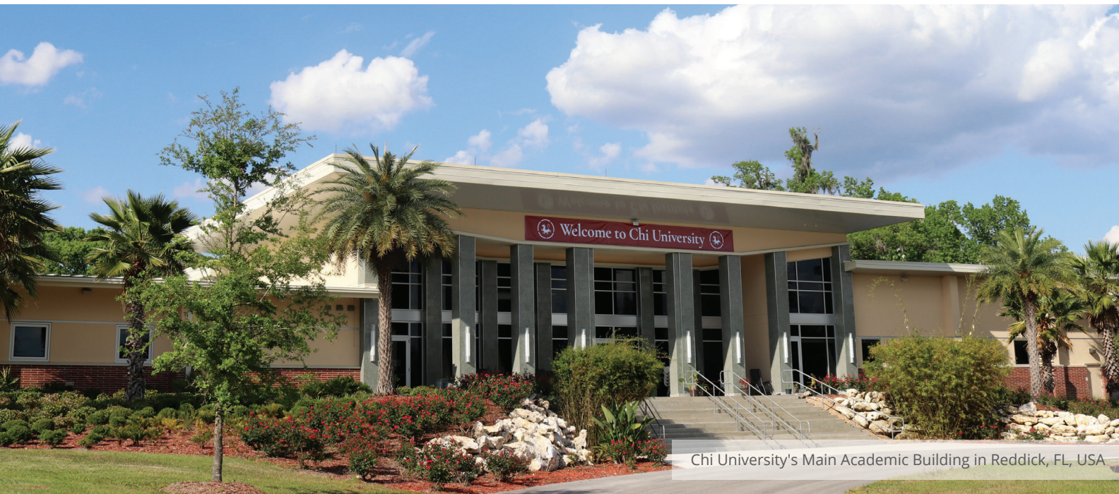
Chi University's Main Academic Building in Reddick, FL, USA