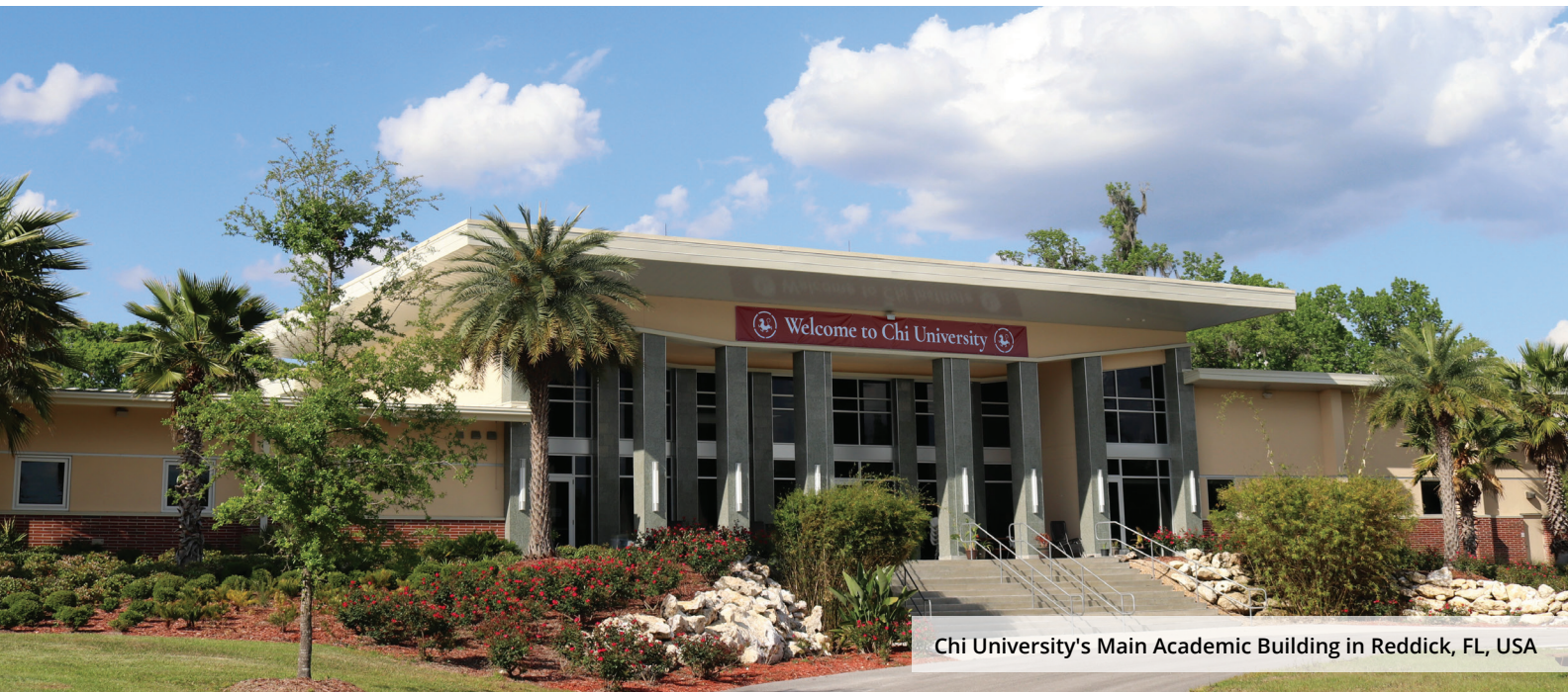
Chi University's Main Academic Building in Reddick, FL, USA