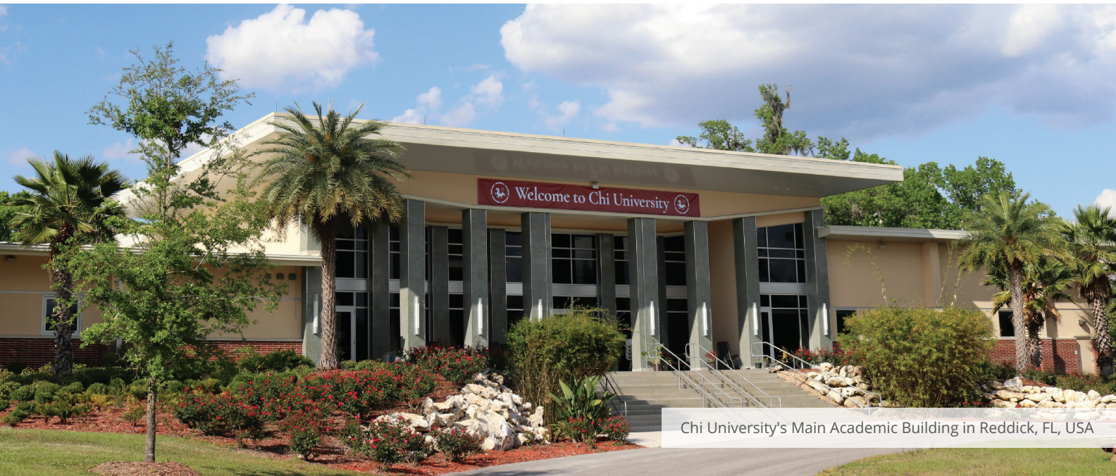
Chi University's Main Academic Building in Reddick, FL, USA